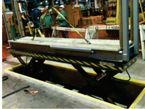
Special Series 35 Double Long