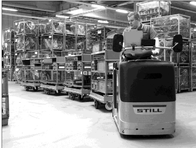
Figure 1: A Still tugger train at a Fendt facility

The shift from forklift trucks to tugger trains is, however, by far more than just a replacement of one type of transport vehicle by another. The latter interlink a so-called supermarket (i.e. parts warehouse) with multiple delivery locations (stops, e.g. assembly stations) along a transport route in a milk-run. But at several stops along the assembly line, the demand of articles varies in type, weight and volume over time (due to product variety) – while their delivery is rigidly tied together by the row of trailers and a rather rigid schedule: the implementation of a tugger train system usually aims at a uniform supply process, preferably according to a timetable.