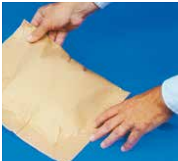
Cro-nel®, ready to ship