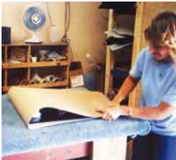
Cro-nel®, sealing metal parts