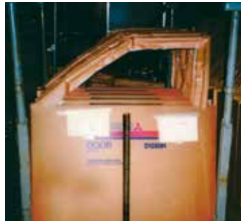
Cro-nel® or Nyvel®, automotive