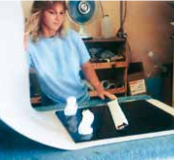
Cro-nel®, positioning metal parts