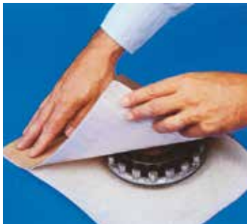
Cro-nel®, seal package