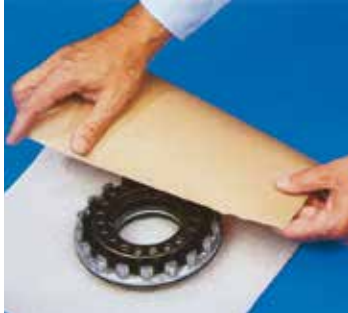
Cro-nel®, position part