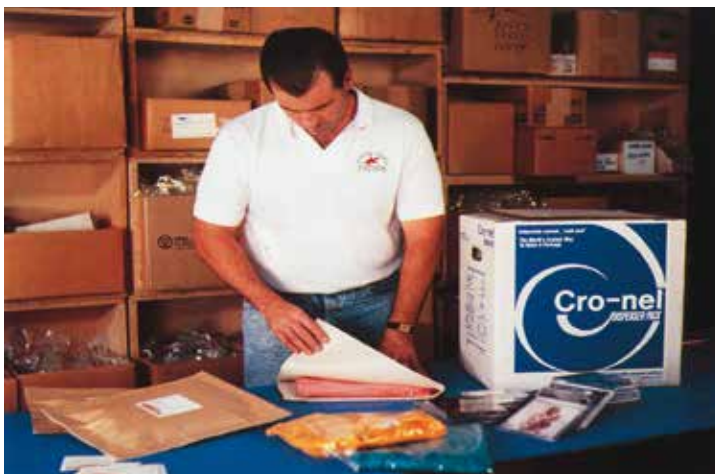
Cro-nel® Dispenser Pack, packaging station