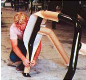
Cro-nel®, roll bar