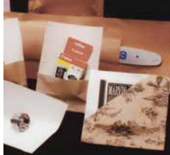
Cro-nel® and Nyvel®, fulfillment