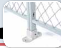
BASE SHOE FLOOR CONNECTION