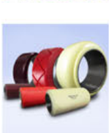
Polyurethane load wheels & tires