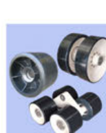
Undercarriage bogie and idler wheels