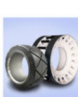
Solid rubber tires and wheels