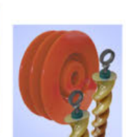
Customized engineered elastomers

1818 Pennsylvania Ave. West, Warren, PA 16365 USA