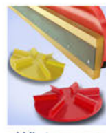
Winter wear parts