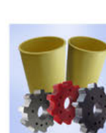
Street sweeper wear parts