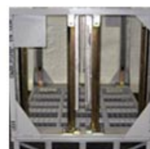
Indexing Tower Racks