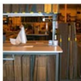
Shipping & Receiving Packaging Benches