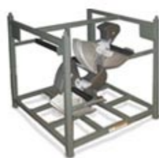
Returnable Equipment Racks (Non-Collapsing)