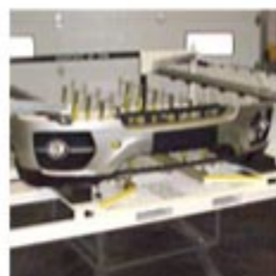
Returnable Bumper Racks