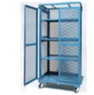
Person-Aboard Order Picking Modules