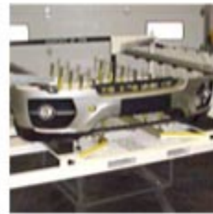
Returnable Bumper Racks