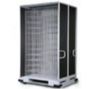
Portable Storage Modules