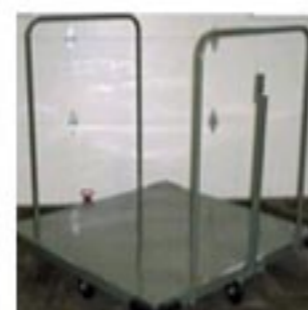
Purpose-Built Platform Trucks