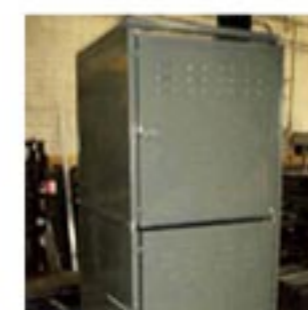
Custom Storage Lockers