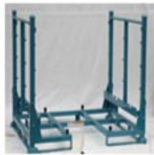
Returnable Equipment Racks