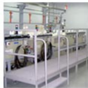
Custom Operations Platforms