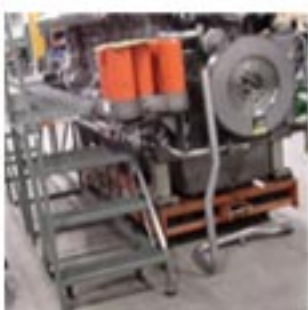
Assembly Floor Work Platforms