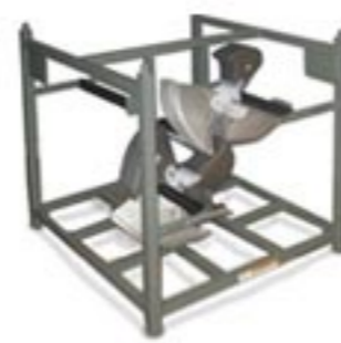
Returnable Equipment Racks (Non-Collapsing)