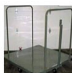
Purpose-Built Platform Trucks