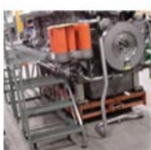
Assembly Floor Work Platforms