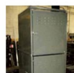
Custom Storage Lockers