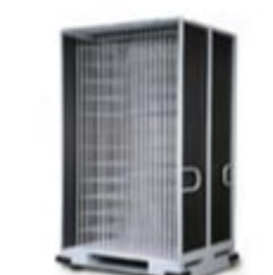
Portable Storage Modules