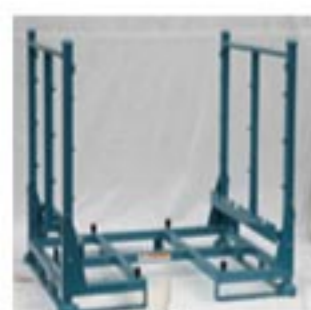
Returnable Equipment Racks