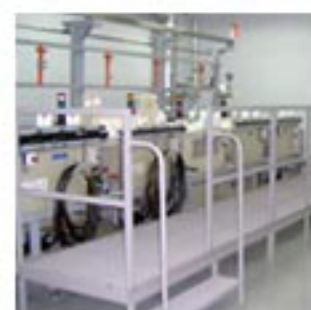
Custom Operations Platforms