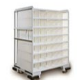
Portable Bin Cart Modules