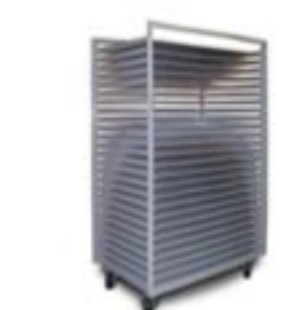
Flat Media Tray Carts