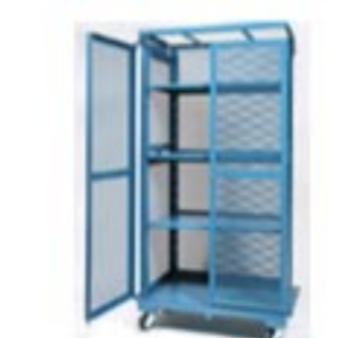
Person-Aboard Order Picking Modules