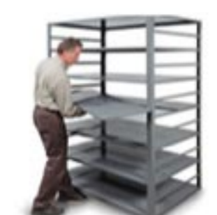
ASRS Archive Modules