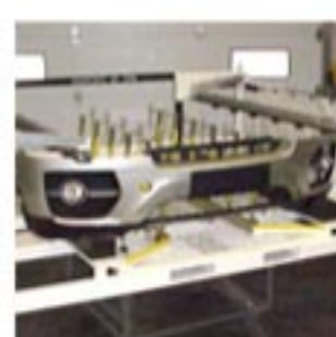
Returnable Bumper Racks