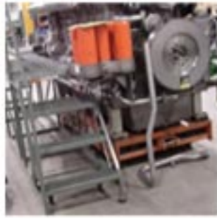
Assembly Floor Work Platforms