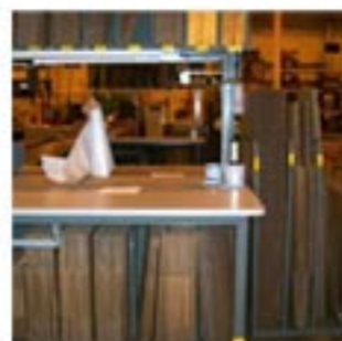
Shipping & Receiving Packaging Benches