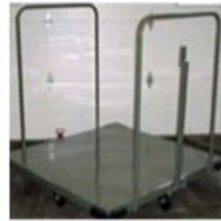
Purpose-Built Platform Trucks