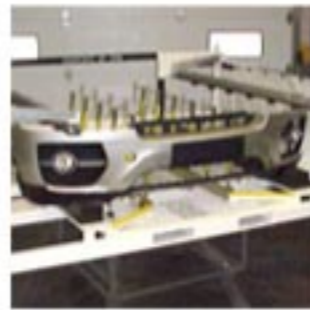
Returnable Bumper Racks