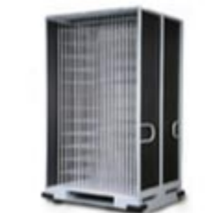
Portable Storage Modules