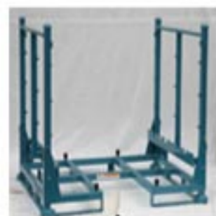
Returnable Equipment Racks