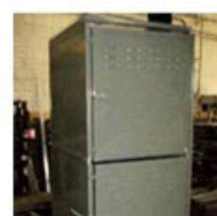
Custom Storage Lockers