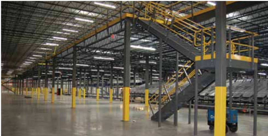
Lighter weight, more flexible ResinDek mezzanine flooring eliminates steel structure and footings.