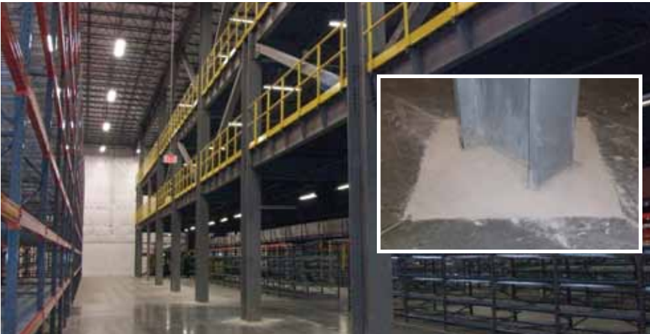
Concrete mezzanine floors require massive amounts of extra steel and footings driving up costs.