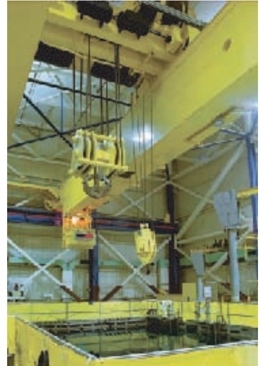
125 Ton Nuclear Fuel Handling Crane