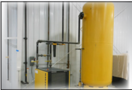
Simply connect the CA to existing plant air or a centralized compressor.