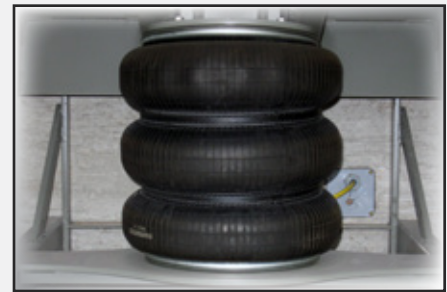
Steel belted rubber bellows system uses compressed air to raise platform.