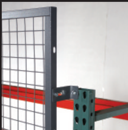
Panels extend above top beam for complete protection