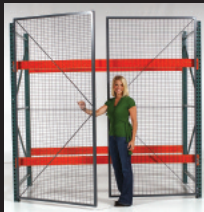
Hinged doors for rack enclosure

6208 Strawberry Lane Louisville, KY 40214 800-626-1816 www.wirecrafters.com