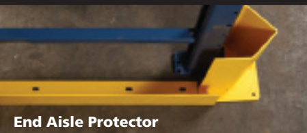
End Aisle Protector

Shield overhead door track from lift truck damage with WireCrafters Door Track Guards. Available in 24" and 36" heights. Formed heavy duty 3/16" steel, with 1/2" base plate, anchors to floor and wall, allows doors to operate freely while protecting tracks from damage.