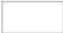
39/10010 Sky White