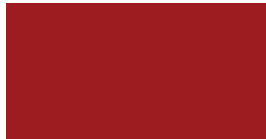
39/30100 Fire Engine Red