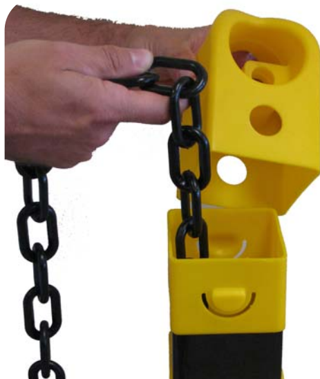
Cap can be removed for chain storage and to add ballast

Sentry Guard Post is a very simple way to add attractive, visible, versatile bollards to your facility. With the many different options available, including colors, finishes, tape and signs, you can create a post that fits your needs.