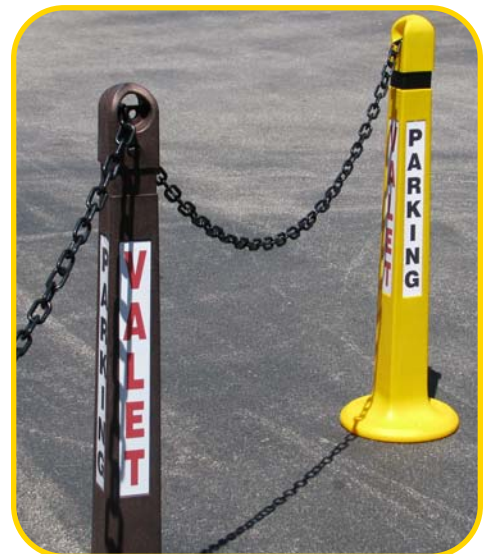
Custom inset messages available

Guard Post is available now from Sentry Protection Products and its many authorized distributors.