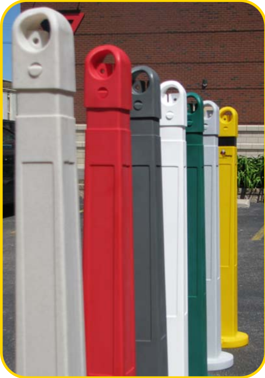
Optional colors and finishes are available