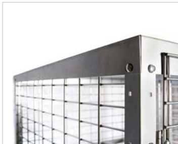
18-gauge, galvanized steel sloping roof sheds water and ice