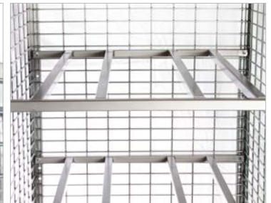
Shelves help to keep your gas cylinders from moving around the cabinet