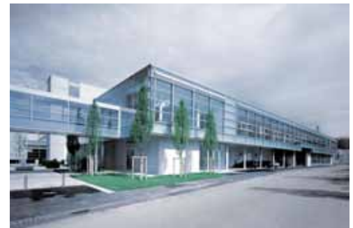
TGW, Wels, Austria