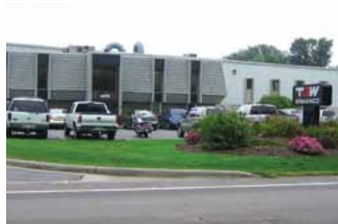
TGW Systems, Spring Lake, Michigan USA