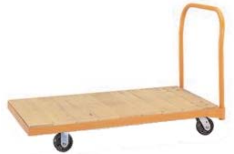
Central Supply Carts