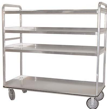
Queen Mary Cart