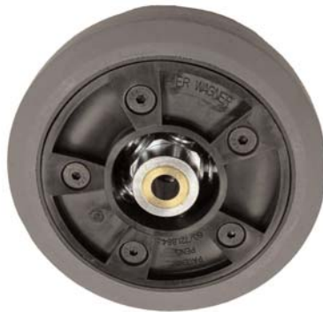
Thermoplastic Rubber Tread