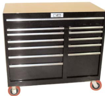
Mobile Tool Box