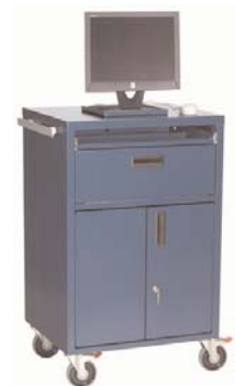
Mobile Technology Workstation