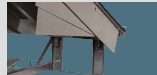
Full width rear hinge in compression with structural channel rear frame supports.