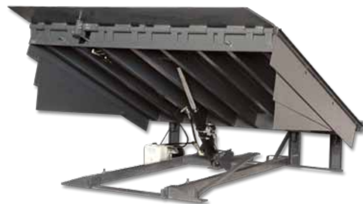
*Shown with structural C & I beam deck support and optional weather seal

NOVA's NHS Series Premium Hydraulic Dock Leveler incorporates the use of hydraulics to raise and lower both the platform and lip. A single push-button activates a hydraulic pump for operating both the leveler platform and lip cylinders.