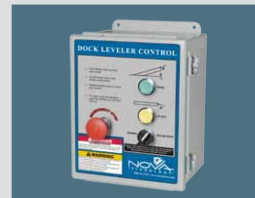
Optional integrated control panel for leveler, restraint, and door. Many other options available.