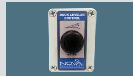
Push-button operation for smooth, consistent operation with a hydraulic system that provides for full float at all positions.