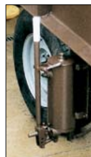
HYDRAULIC HAND PUMP