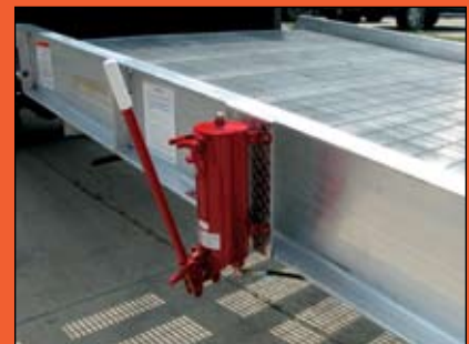
HAND PUMP HYDRAULIC LIFT