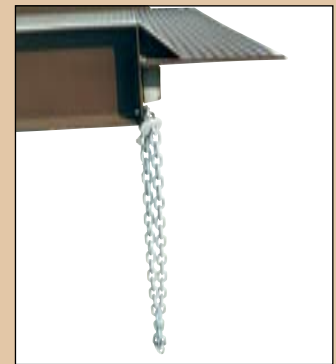
SAFETY LOCKING CHAINS WITH 15" OVERLAP LIP