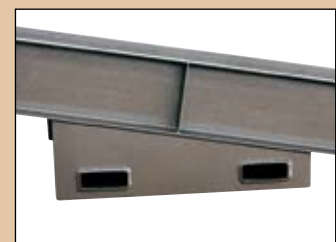
FORK LIFT PICK-UP SLOTS