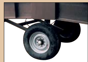
27" PNEUMATIC TIRES