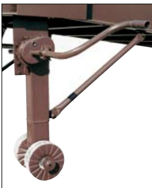
MANUAL HAND CRANK & 9" STEEL WHEELS