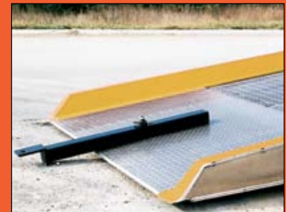
TOW BAR HITCH Shown with Optional Yellow Curbs