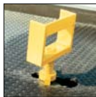
TOW BAR LOOP