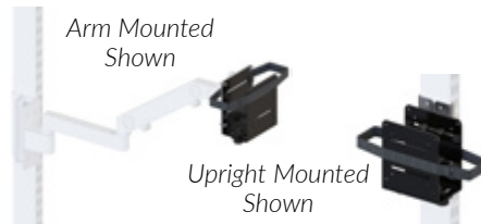
Arm Mounted Shown