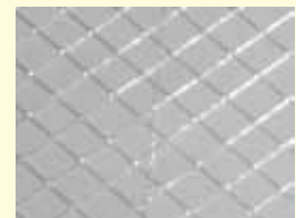
Spillex* 10 Mil Polyethylene