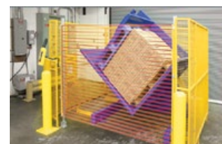
LIGHT CURTAINS: Provides a soft guarding across the front of the machine for additional protection