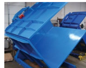
CUSTOM-SIZED TABLE: Larger and smaller platforms available for custom-sized loads