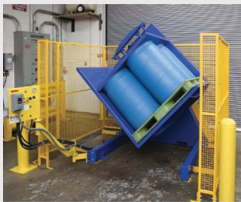
EASILY TRANSFER DRUMS FROM ONE PALLET TO ANOTHER