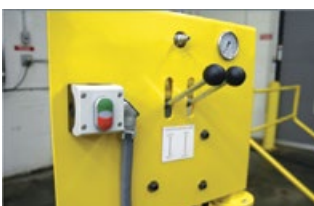
LEVERS: Basic control package will turn machine on/off, as well as clamp, un-clamp, and rotate