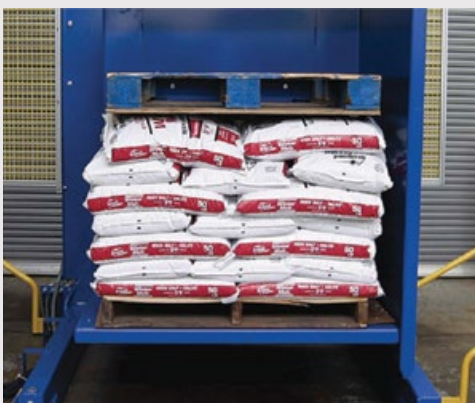
QUICKLY RECOVER DAMAGED GOODS OR BROKEN BOARDS FROM THE BOTTOM OF THE STACK