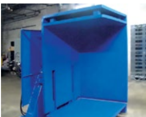
PROFILE PLATES: Used to reduce maximum and minimum jaw opening