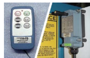
WIRELESS REMOTE: Receiver mounts to machine