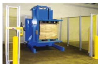
BOSCH GUARDING: Guarding which bolts directly to the floor with removable panels for maintenance access