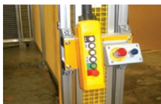
PUSH BUTTON: Comes on a 30-foot cord with E-stop, lock out tag/out and pendant holder