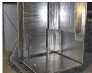
CUSTOM PAINT FINISHES: Stainless steel, food-grade Steel-It, and custom color match paint