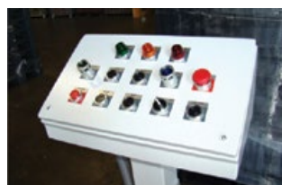
CONSOLE: Offers added operational features to provide maximum control of machine