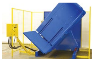
HIGH STYLE GUARDING: Provides additional protection for forklift operators (mounted directly to the machine)