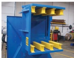
STAND OFFS: Allow for pallet-less loading and unloading