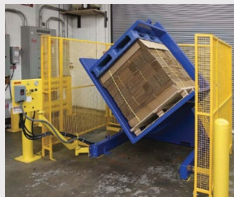
SAFELY TRANSFER CORRUGATE FROM A WOOD PALLET TO A PLASTIC PALLET