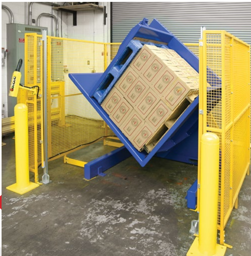
EASILY TRANSFER BOXES FROM A WOOD PALLET TO A PLASTIC PALLET