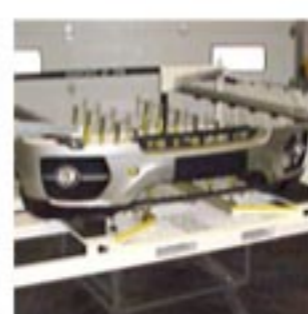
Returnable Bumper Racks