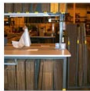
Shipping & Receiving Packaging Benches