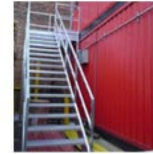
Galvanized Industrial Stairways & Landings