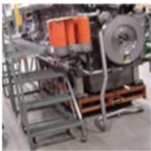
Assembly Floor Work Platforms