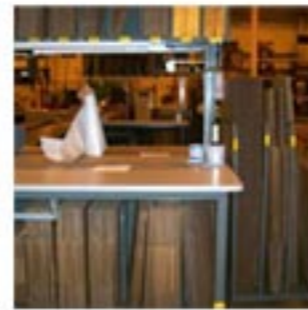
Shipping & Receiving Packaging Benches