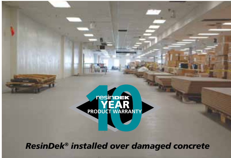
ResinDek® installed over damaged concrete