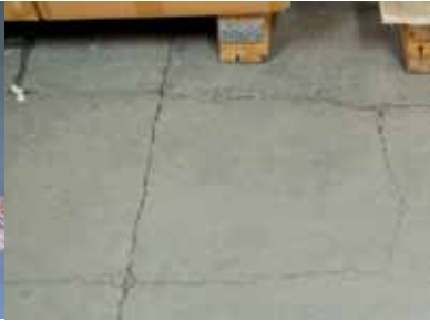
Cracked, spalling & uneven concrete