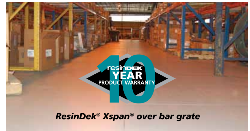
ResinDek® Xspan® over bar grate