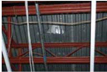
Heavily loaded pallet trucks caused failure of both concrete and B-Deck

"We are grateful for the ingenuity and support provided by Daigle Engineers and Cornerstone Specialty Wood Products. And now that we know about ResinDek® and its added benefits with savings we will be considering ResinDek® instead of concrete for future projects."