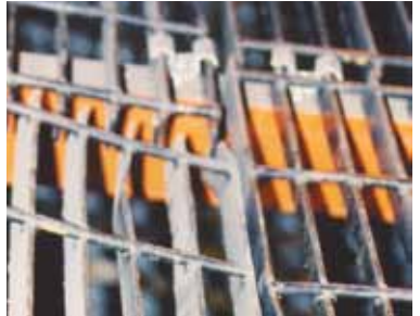
Deformed and damaged bar grate & plank grating