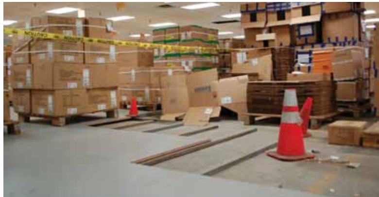
ResinDek® installation with steel sleepers over damaged concrete