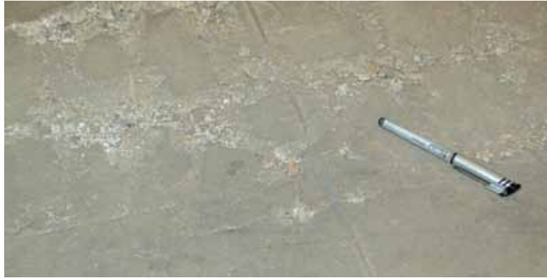
Concrete mezzanine flooring with significant damage prior to ResinDek®