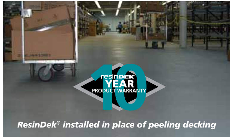
ResinDek® installed in place of peeling decking