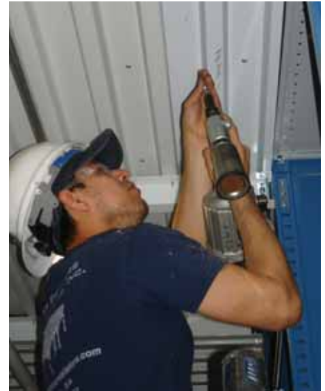
Figure A Invisi-LOC ® Underside Fastening System

Please contact Cornerstone Specialty Wood Products, LLC for product details, warranty, tool sales, and rentals.