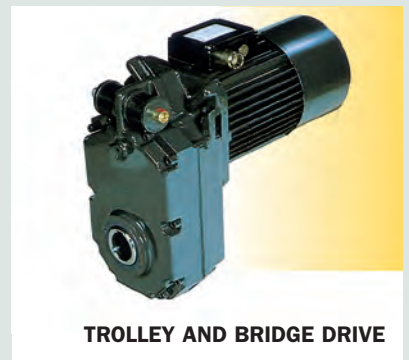
TROLLEY AND BRIDGE DRIVE

For both end-users and crane builders, we support our component line with after-sale service and spare parts for the life-span of the equipment. In the case of a Konecranes gear reducer, this may seem like forever.