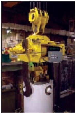
Canister Grab Engaged

SAFLIFT™ technology is the culmination of American Crane's experience as the market leader in nuclear fuel handling. SAFLIFT™ was designed to overcome the many problems encountered with outdoor vertical canister/cask transfer facilities. The flaws of the outdoor vertical transfer facilities show that a material handling expert, not cask experts, should design these type systems. ACECO's revolutionary, patented design of SAFLIFT™ is testament to its commitment to providing safe and cost effective material handling solutions.