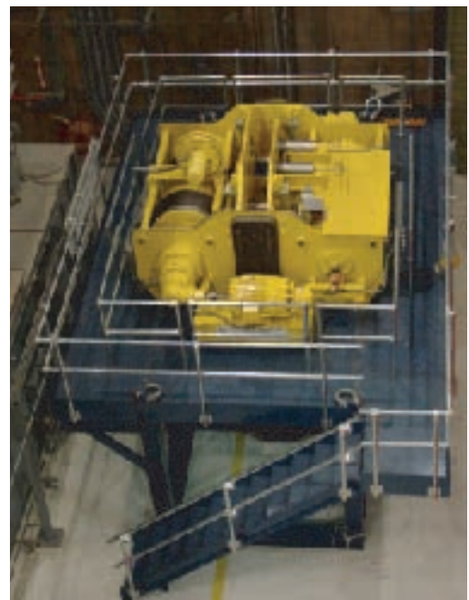
SAFLIFT™ in Storage Stand