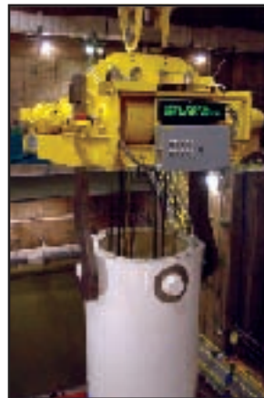
Canister Transfer Complete