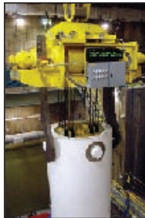
Canister Hoist Lowering