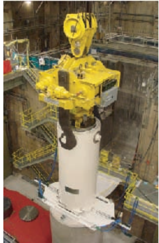
SAFLIFT™ Transferring Canister to Cask

SAFLIFT™ is built in accordance with our 10CFR50 Appendix B Quality Assurance Program utilizing our ULTRASAF™ Single Failure-Proof Lifting Technology.