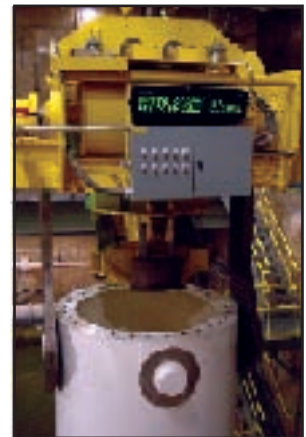
Remote Grab Disengaged