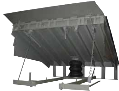
CentraAir® Series 7'x 8' 35,000 CIR with brush weather seal shown.

For over 50 years and beyond, throughout various industries, Poweramp dock equipment continues to exceed all material handling industry standards.