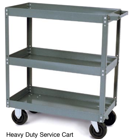
Heavy Duty Service Cart 3 Shelves