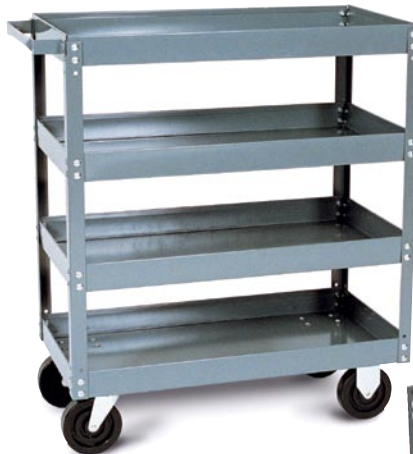
Economy Service Cart 4 Shelves