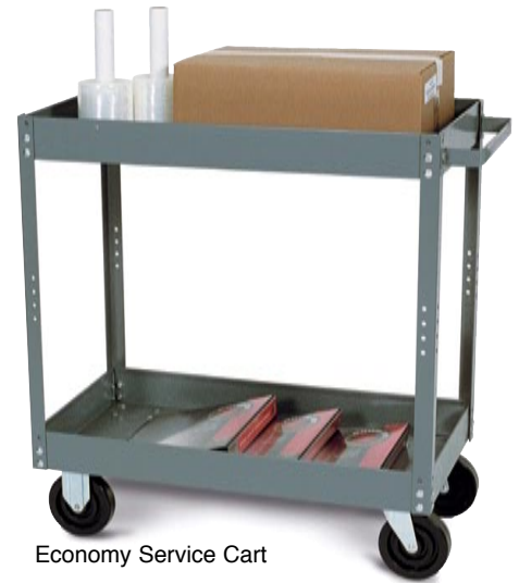
Economy Service Cart