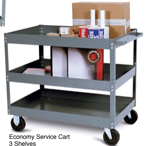
Economy Service Cart 3 Shelves