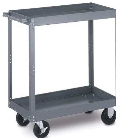
Heavy Duty Service Cart 2 Shelves