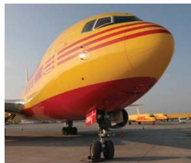
Deutsche Post AG.