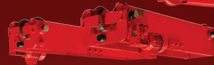
Under Hung End Trucks