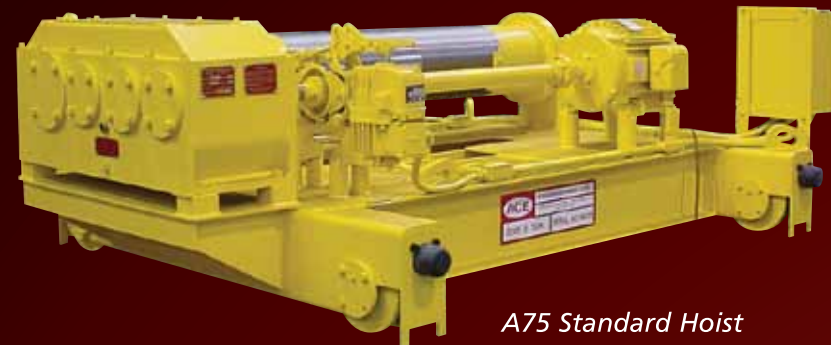
A75 Standard Hoist

The A40 and A75 Series Built-up Hoists have been operating throughout the US for over 20 years. This fully Decked Hoist was designed for heavy-duty applications and is available in 5 to 80 ton capacities.