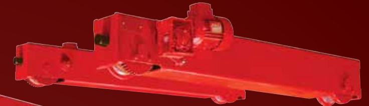
Top Running End Trucks