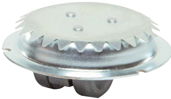
Upside down view showing the swiveling wheel mechanism

RoTo-Fix Casters have a non-tipping low profile design allowing for easy installation. Simply drill a 3 3/8 " hole that has a 3/4" clearance and push the spring cup caster into the hole until it is flush with the mounting flange. Applications: Wooden display counters and cases, furniture, TV stands, kitchen counters and islands.