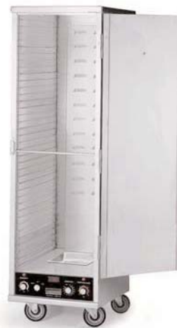
Food Service Cart