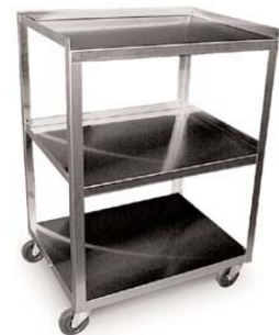
Stainless Steel Utility Cart