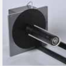
D. REWIND MODULE