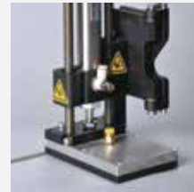
B. PNEUMATIC TAMP MODULE