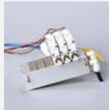
A. PNEUMATICS MODULE