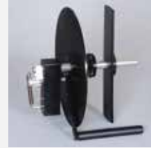
E. UNWIND MODULE