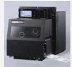
C. PRINT ENGINE MODULE