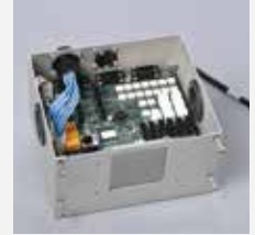
F. ELECTRONICS MODULE