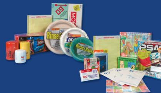
HORIZONTAL SHRINK WRAPPING

ARPAC L.P. 9511 West River Street Schiller Park, IL 60176 P 847 678 9034 F 847 671 7006 www.arpac.com