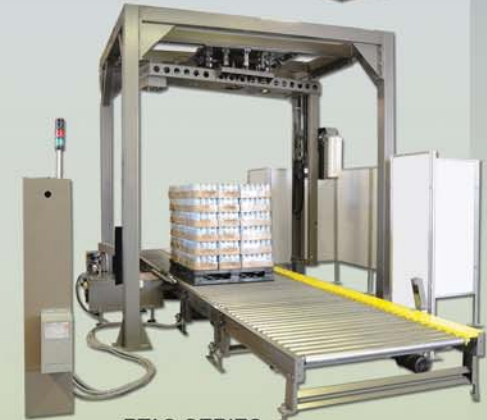
RTAC-SERIES Available in single post and dual post configuration Speed up to 30 rpm