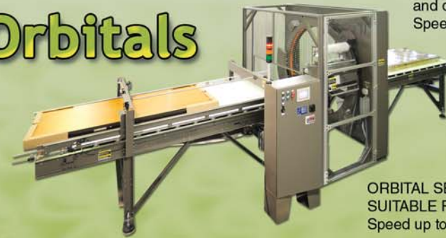
ORBITAL SERIES SUITABLE FOR LONG PRODUCTS Speed up to 30 rpm