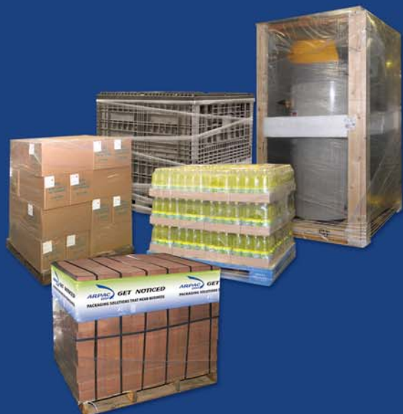
PALLETIZING & STRETCH WRAPPING