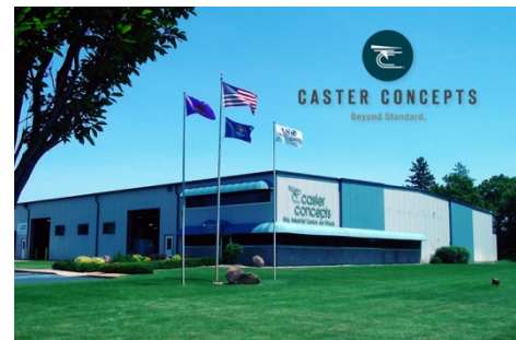
Caster Concepts, beyond standard solutions