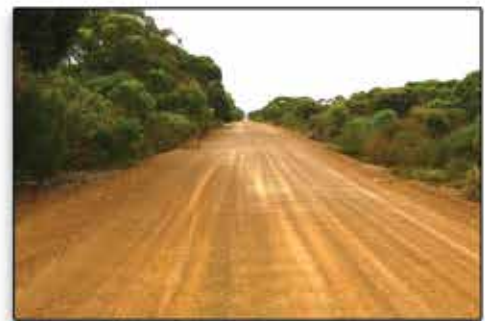
Dirt or Paved Roads