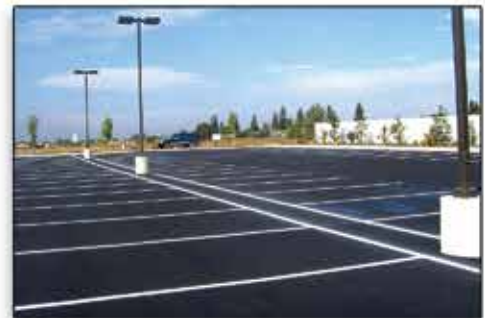
Large Parking Lots

Like the smaller push-type and hang-type models, these heavy-duty pull-type sweepers save time and maintenance costs by keeping areas free of tramp metal debris. The heavy .375" x 2" steel frame with adjustable hitch withstands the roughest conditions. They are designed to operate at road speeds up to 50 mph between jobs, and up to 10 mph during sweeping. Each sweeper has two large, heavy-duty magnets, each has 90 lbs. pull, and feature permanent magnetism with a lifetime warranty. Releasing collected metal is easy too. Simply pull the lever, and the load is released from the stainless steel collecting plate into the carrying pans.