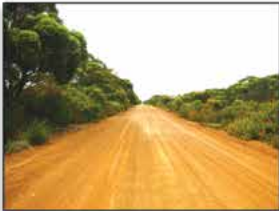
Rural Dirt Roads

Magnetic sweeper applications can be found in a variety of industries, so Master Magnetics offers a wide selection of magnetic sweepers to suit virtually every situation and need.