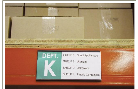
Magnetic Data Card Holder kits are available in four standard widths.

Our seasoned team of magnetic solutions specialists can help you choose the right magnetic label material to help organize your space. Contact us for samples and solutions!