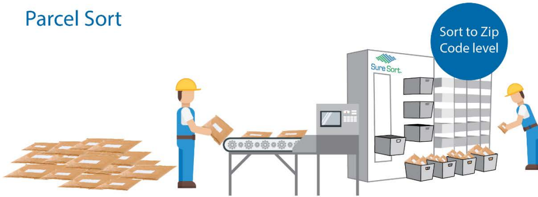
Figure 3: Small parcels can be sorted to the zip code level for shipping efficiency and to reduce costs.

Kitting –Sure Sort can speed the process of pairing like items into multiple kits. Think: Subscription “Item of the month” clubs or “meal delivery” clubs, for example. Individual items can be inducted into Sure Sort and delivered quickly to order trays until all kits are filled with the desired items for that day’s shipment.