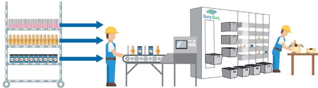
Figure 1: Batch picked orders are consolidated for shipping using Sure Sort in the diagram above.

Retail store distribution / Brick and Mortar – Efficient sortation and collection of orders to be distributed to retail stores, or even other DCs with in your supply chain network.