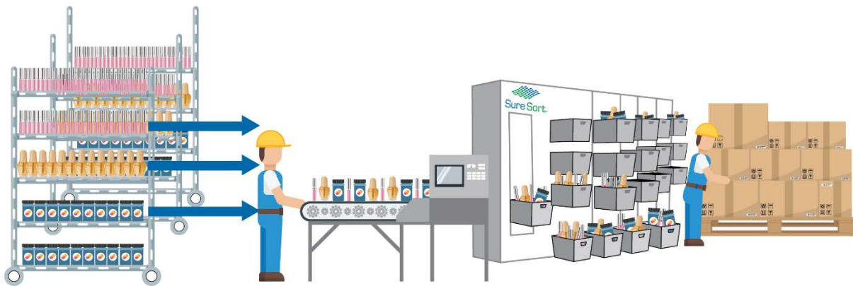
Figure 2: Items for shipment to stores and DCs are sorted into orders using Sure Sort in the above diagram.

Parcel Sortation / Presort - Presorting by zip code or mail zone, reducing shipping charges since shippers will not need to presort their items.