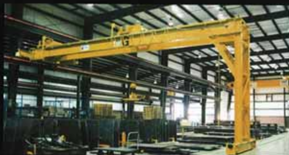
Single leg double girder gantry crane has a 10-ton capacity and Class E duty cycle.

24 Hour Emergency Service 1-800-860-6680 Ohio / Michigan