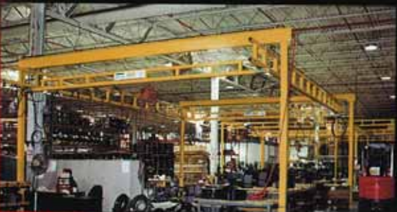
Enclosed track work station is available in many sizes to fit your diverse material handling needs.