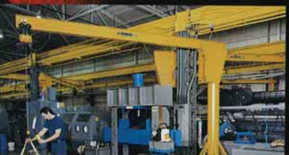
Free standing jib crane can be cost effective when handling repetitive loads in a localized area.

Double girder top running crane installed in a steel service center has 40-ft. span, 35-ton capacity and Class E duty cycle.