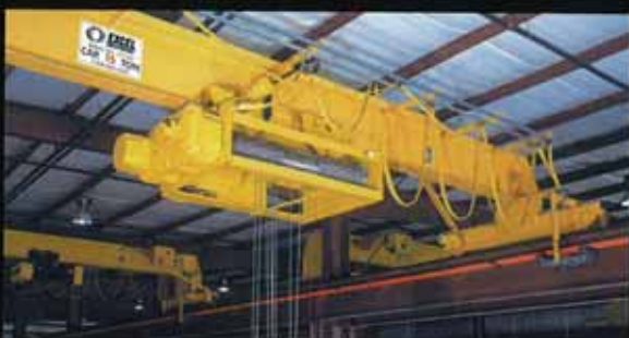
Stepped up top running single girder crane.