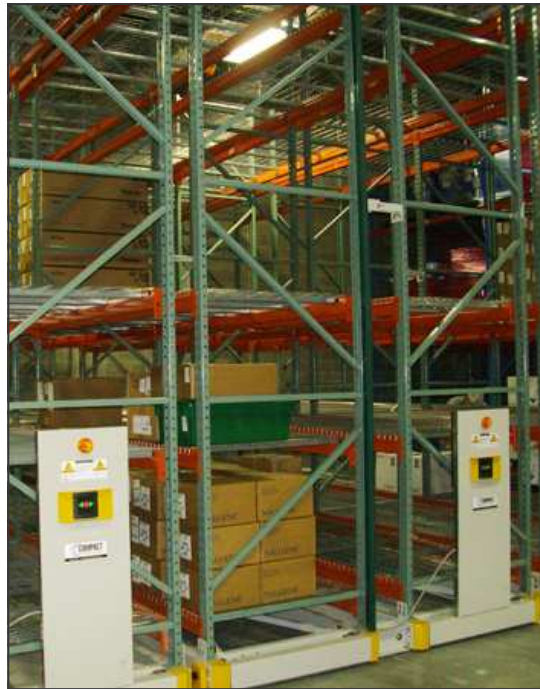
Reach truck accessing open rack area (left, top and bottom). Mobile rack in closed position (right).