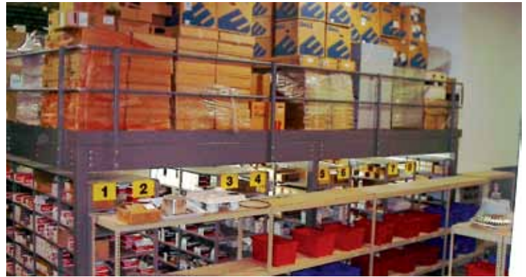
After A free standing mezzanine built around the shelving provides storage space for larger, bulk packages, and makes efficient use of formerly unused space above the shelving. The center gets more storage space at a fraction of the cost of a building addition.