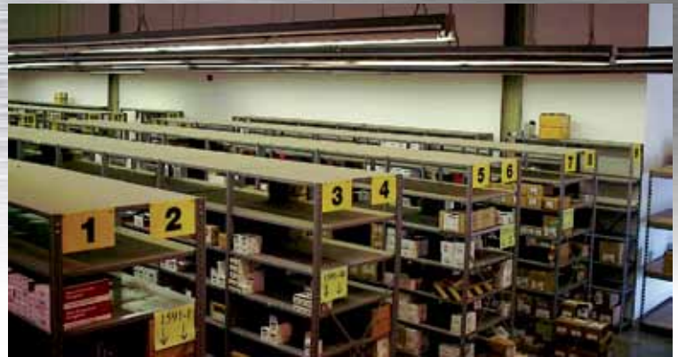
Before Storage in this distribution center is limited to the shelving and to smaller cartons that fit on the shelves.