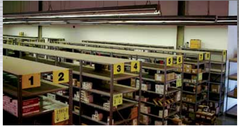
Before Storage in this distribution center is limited to the shelving and to smaller cartons that fit on the shelves.