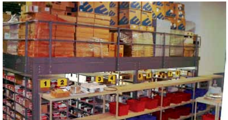
After A free standing mezzanine built around the shelving provides storage space for larger, bulk packages, and makes efficient use of formerly unused space above the shelving. The center gets more storage space at a fraction of the cost of a building addition.