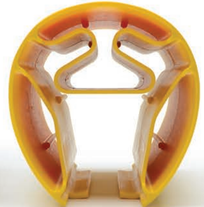
YJ-3x3 Fits 3"x 3" Rack