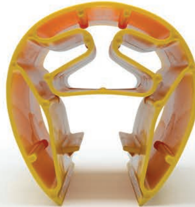
YJ-3x1-5/8 Fits 3"x 1-5/8" Rack

YELLOW JACKET is a state-of-the-art modular rack armor system that is as flexible as you need it to be. Available in two profiles to fit 3"x3" and 3" x 1-5/8" rack uprights. Each 9" tall YELLOW JACKET section is stackable, allowing you to determine the optimal amount of protection for your warehouse racks and equipment. YELLOW JACKET is specially designed to utilize tension to lock into place and includes a secure strap to keep it fastened to the rack. With YELLOW JACKET , it's easy to avoid expensive replacements while protecting your warehouse racks and inventory.