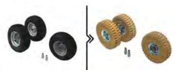
NON-MARKING WHEELS (3 WHEELS)