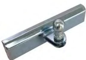
TOWBALL TRAILER HITCH