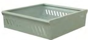
BASKET 650X550XH170 MM