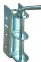
DROP PIN Ø16 MM