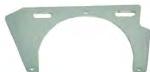
7 KG BALLASTS