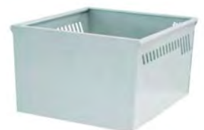
BASKET 690X730XH440 MM