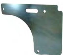
8,5 KG BALLASTS